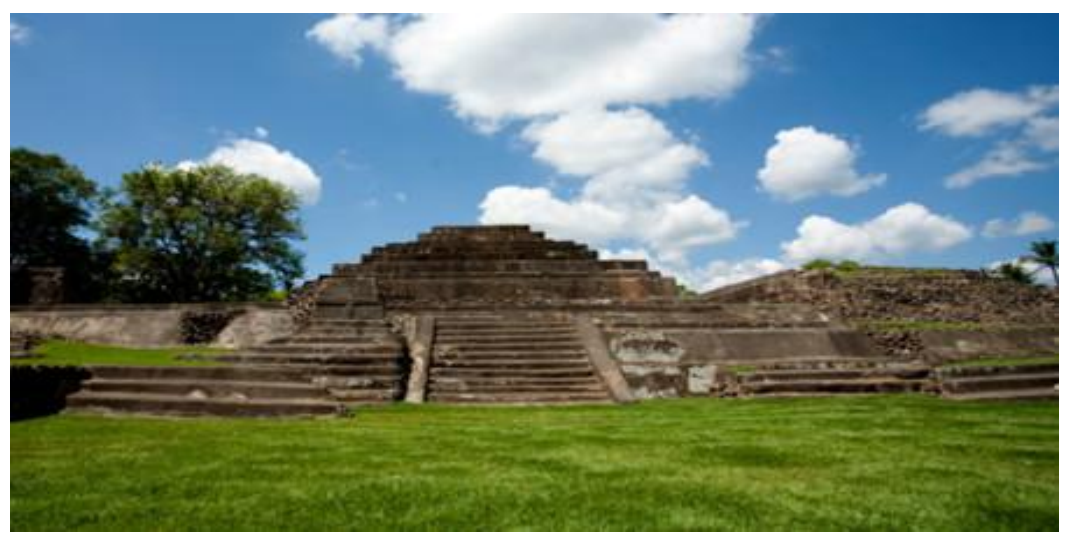
SITIO MAYA EL TAZUMAL Mayan Route: Tazumal

Tazumal, a "place where souls are consumed" in the [Nahua-Quich \epsilon ]