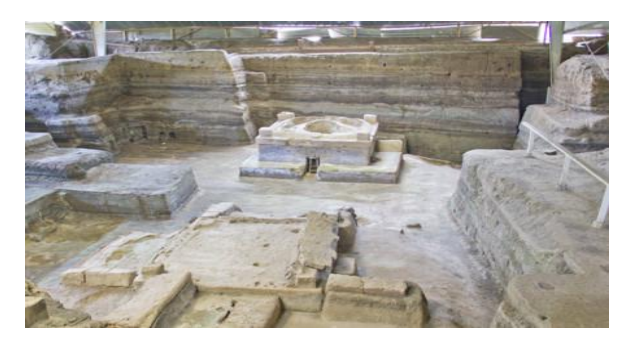
SITIO MAYA JOYA DE CEREN Mayan Route: Joya de Cerén

Joya de Cerén is located in the department of La Libertad and was accidentally discovered in 1976. It is known as "the Pompeii of Central America" since in 600 AD. He was a victim of the eruption of a volcano.